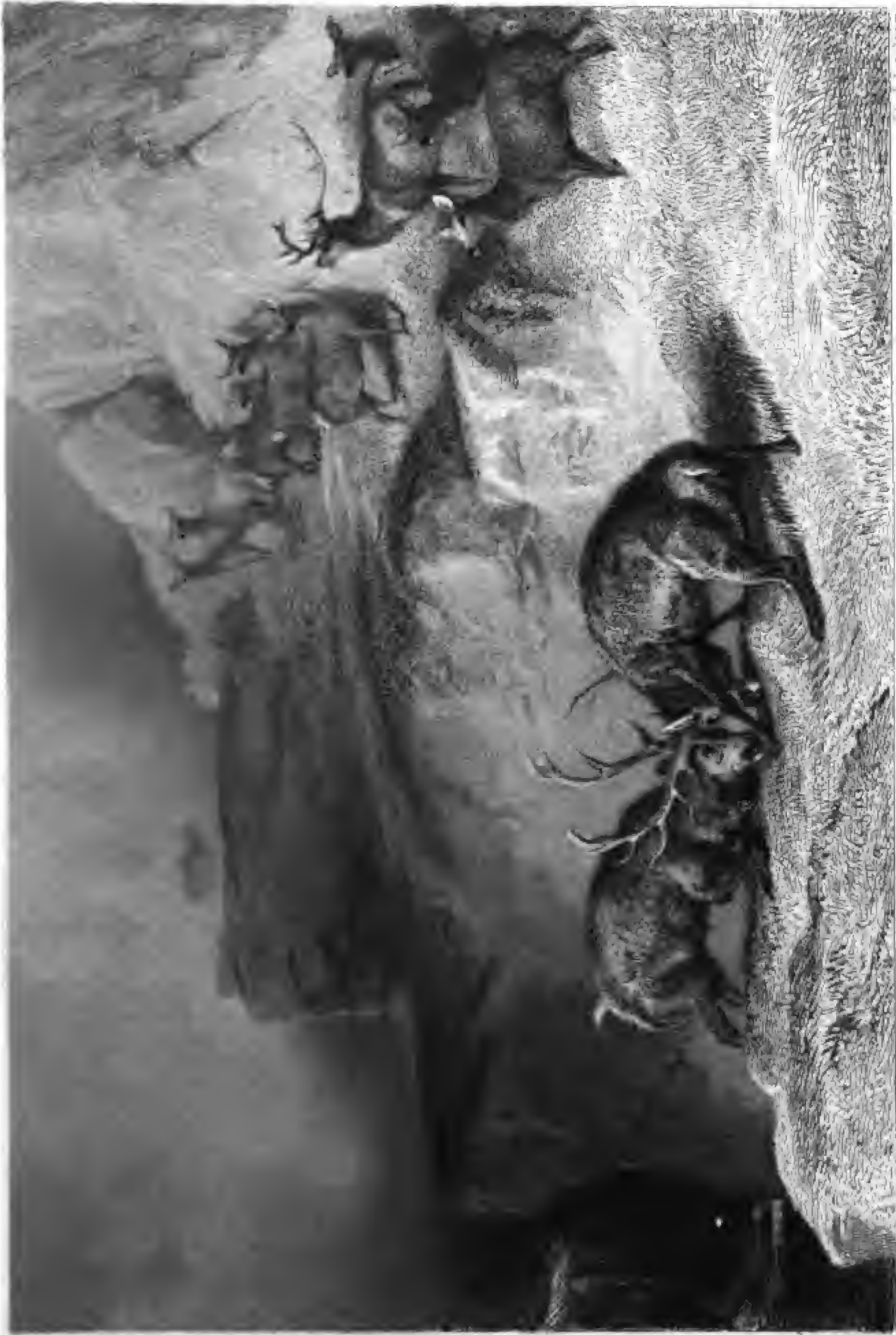
A MOUNTAIN SCENE.